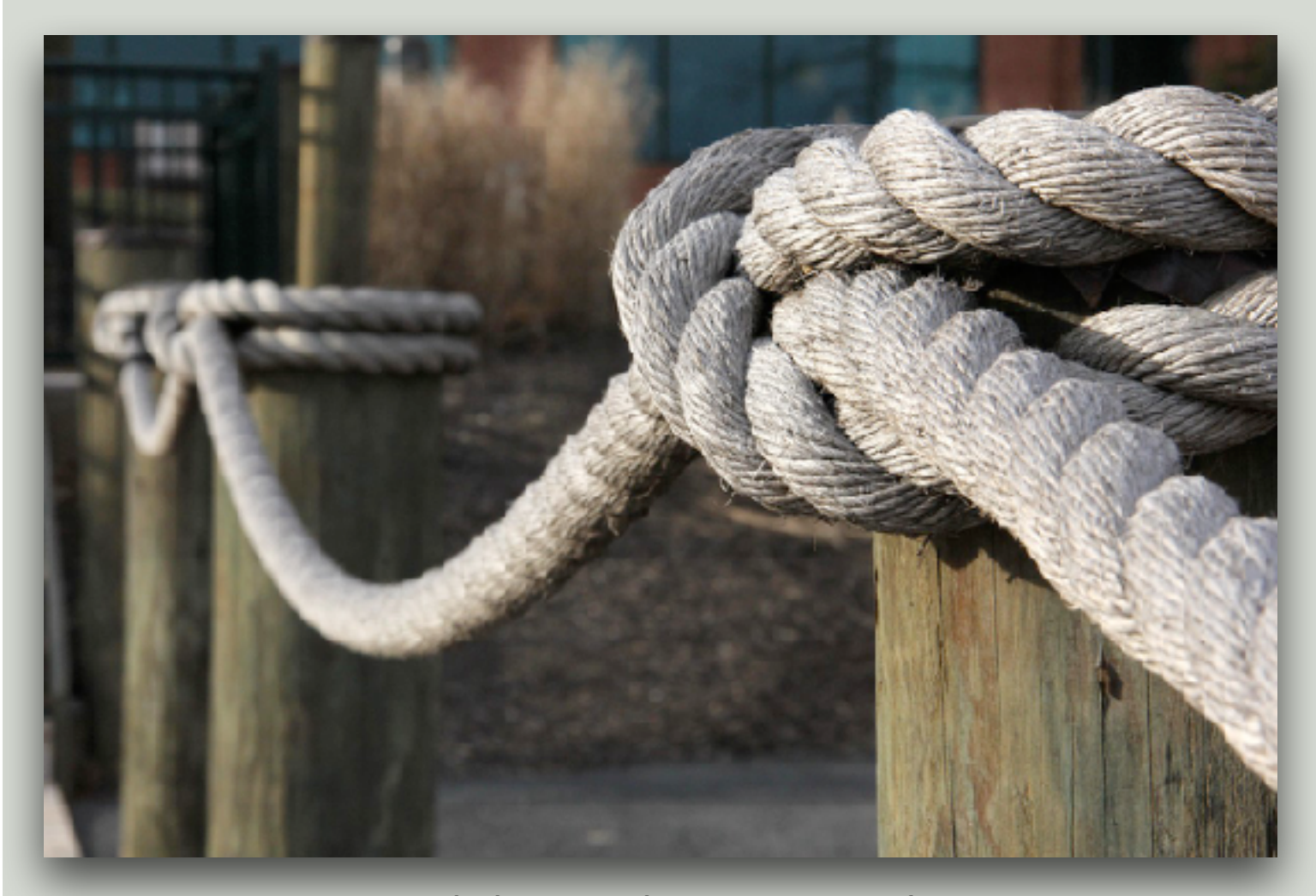
I am weak, but in Christ I am made strong!